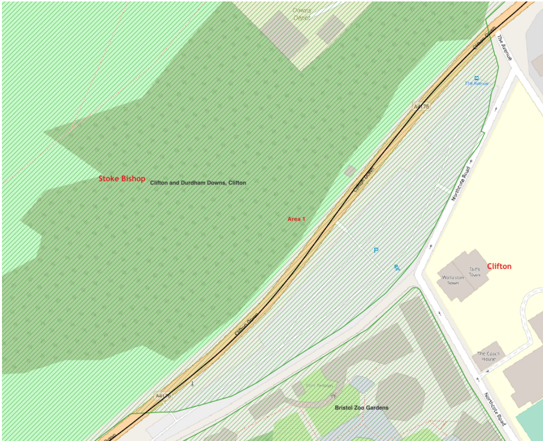
Figure 3 Detail from the Downs IOS designation (hatched in green)